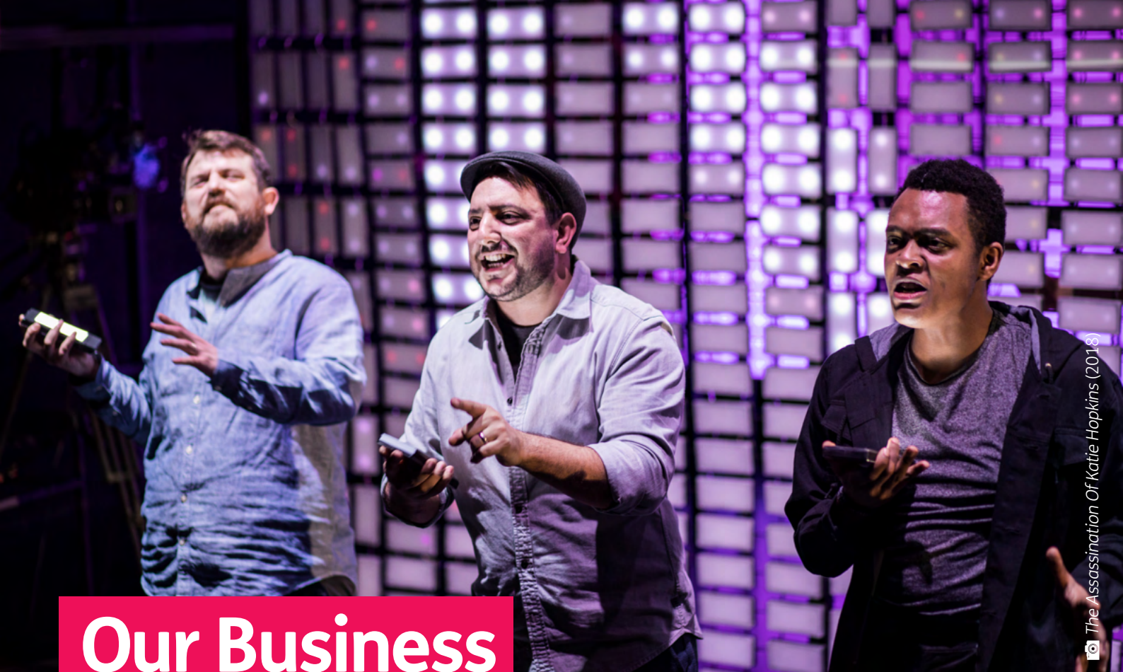
The Assassination Of Katie Hopkins (2018)