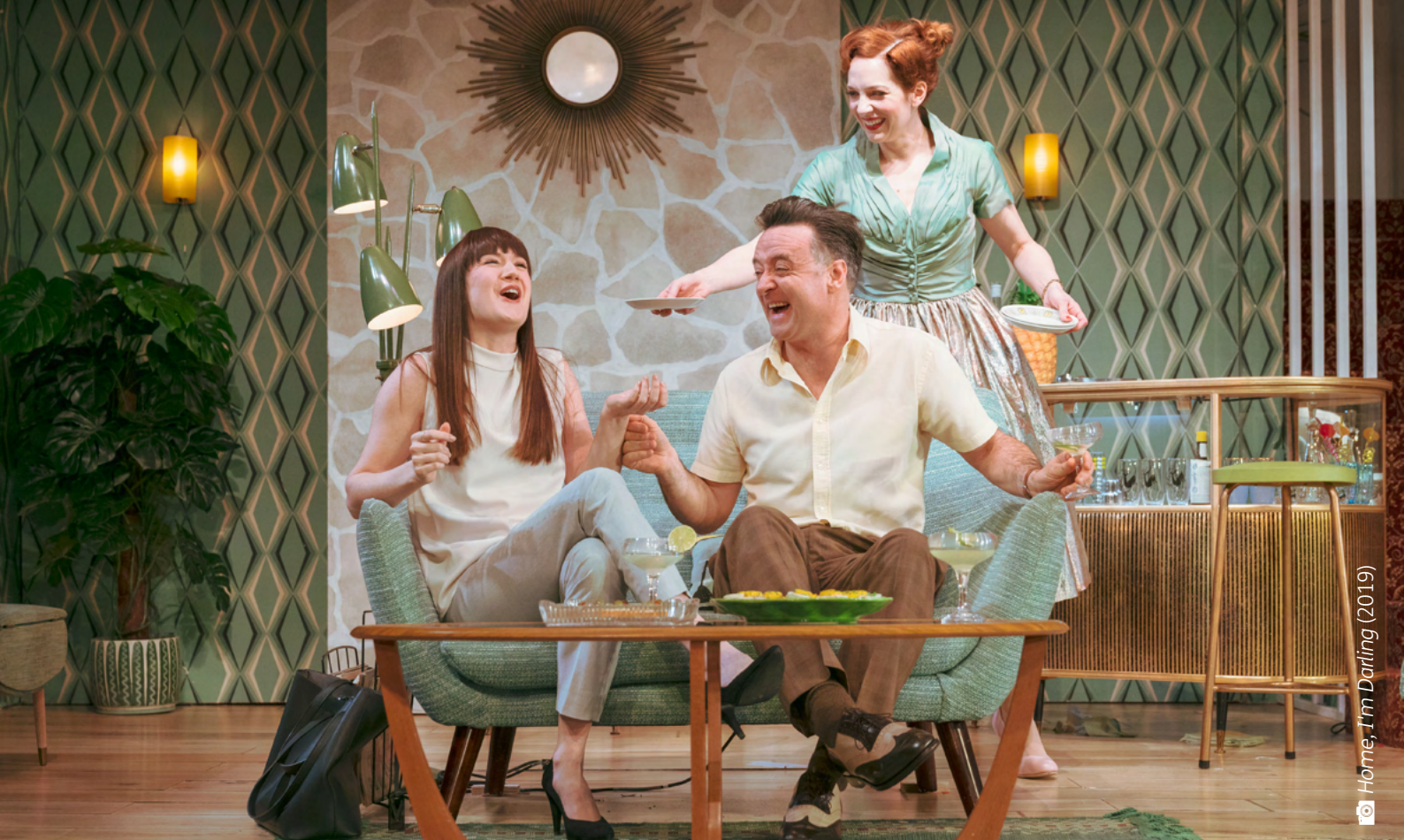
Home, I'm Darling (2019)