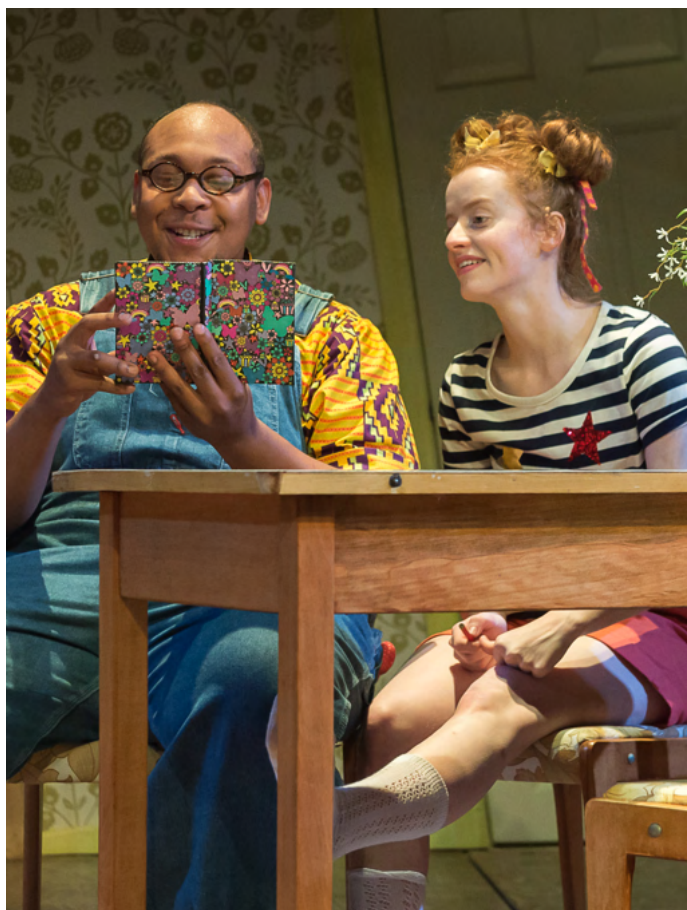
To Dream Again (2016)

We are one of few theatres in the UK to still have scenic construction, costume making, props, and scenic art teams all in-house alongside the lighting, sound, and stage teams. We always aim to offer the warmest environment for creative teams to produce their best work.