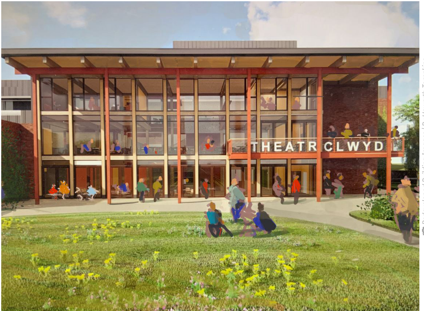
Redeveloped Building Images | By Howarth Tompkins