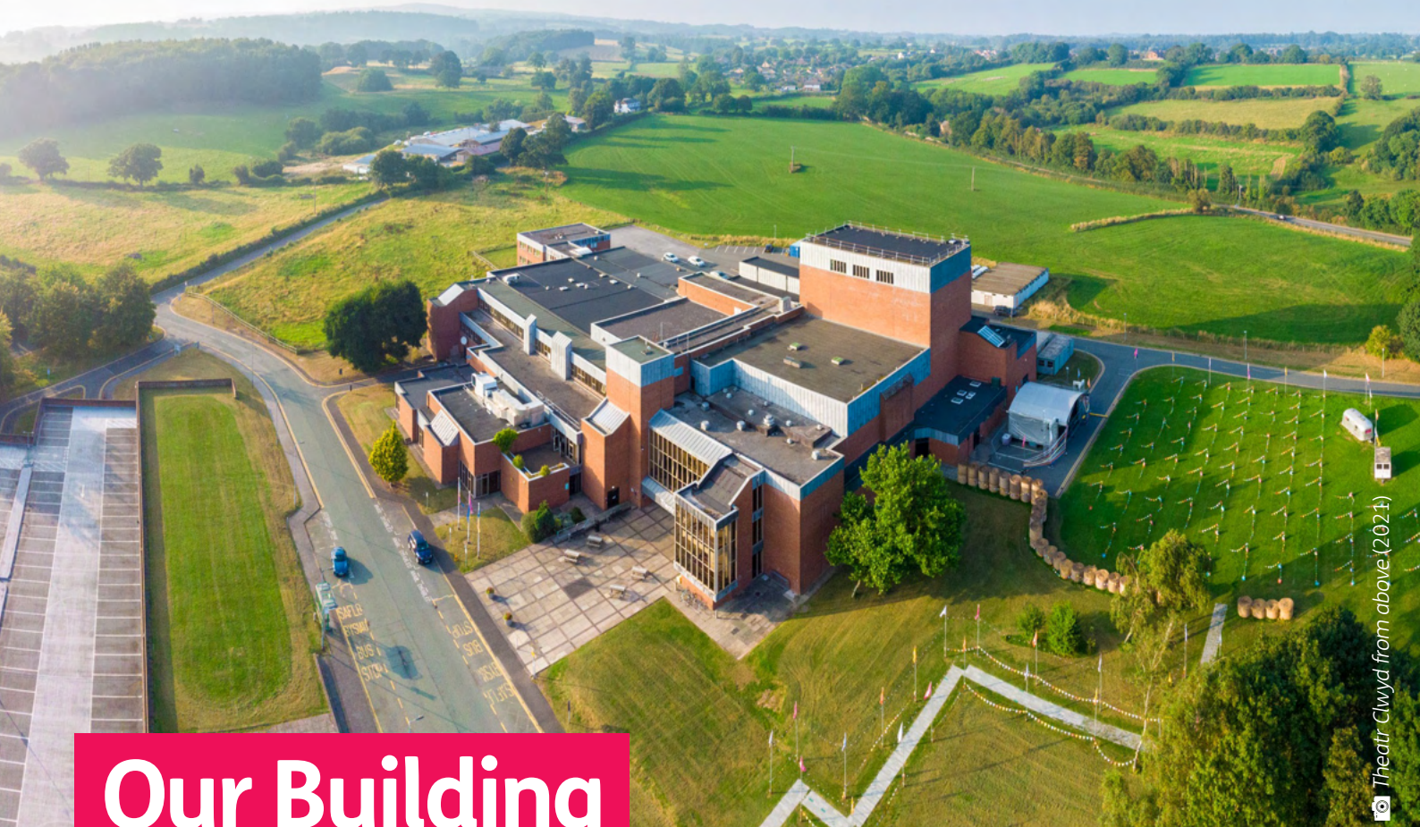
Theatr Clwyd from above (2021)