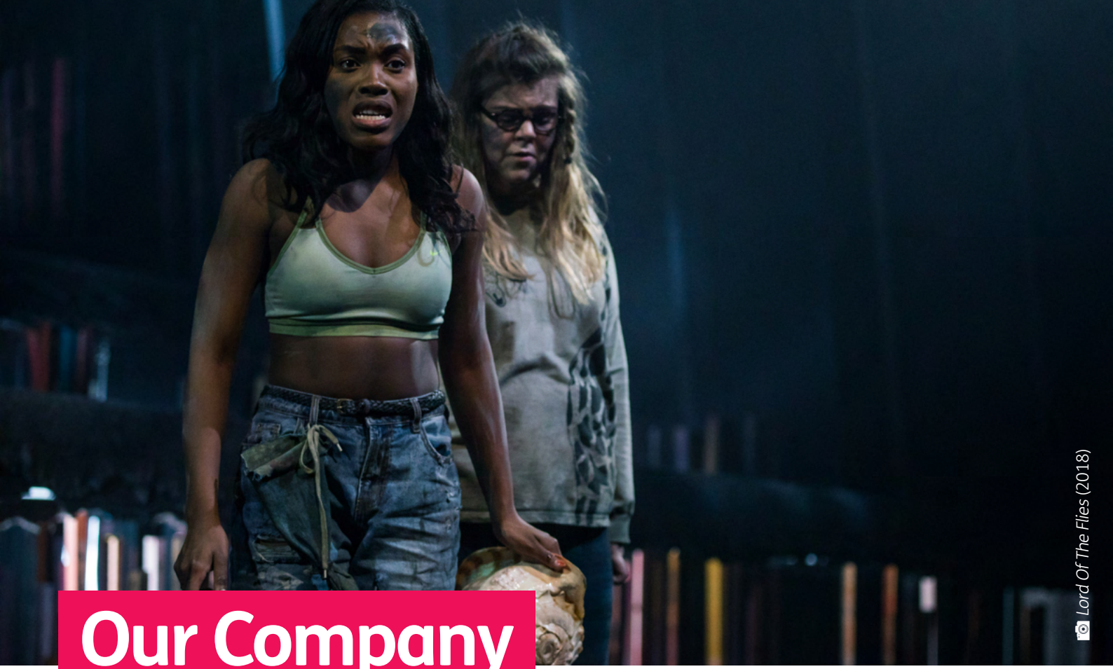
Lord Of The Flies (2018)