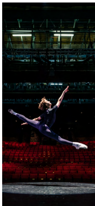
Main House (2019)

There will be dedicated space for training in theatre-making, our work with young people, our referral partnerships for health and wellbeing, and events and catering spaces to help increase revenue generation.